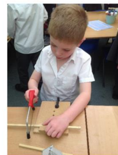
Making pirate ships