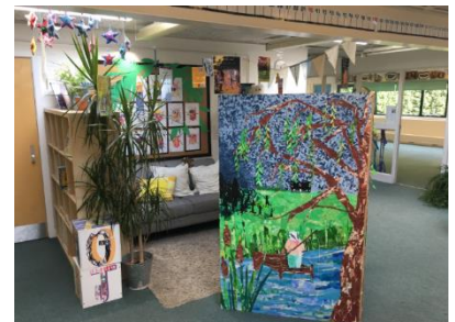
The Year 3 shared area

The first three days back will focus on settling children with their new teacher, understanding rules and systems and knowing where everything is. We will do lots of little tours of the areas so that the children settle well and feel confident in their new environment.