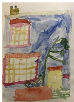
Observational drawing, watercolour use