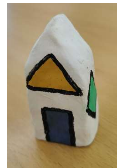
Clay skills, 3D observation, sculpture