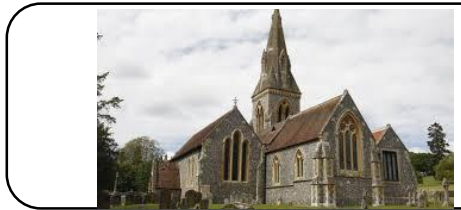
Christians celebrate in a church

Links to other subjects: Science - Light (Y1) Further RE learning throughout the school