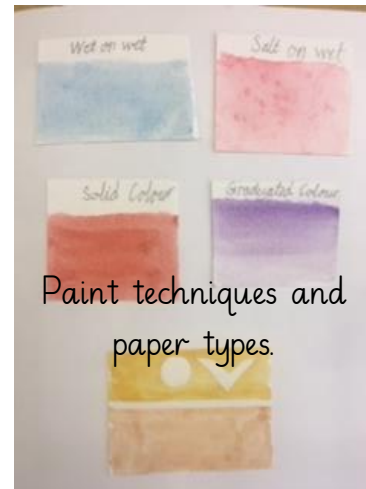
Paint techniques and paper types.