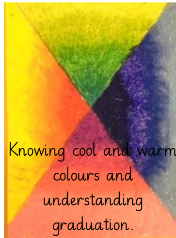
Knowing cool and warm colours and understanding graduation.