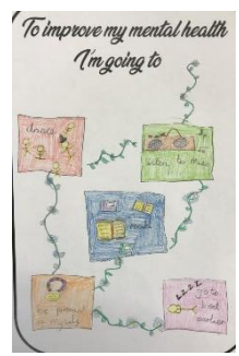
Matching images to emotions