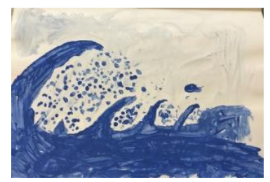
Use of tone within single colour range