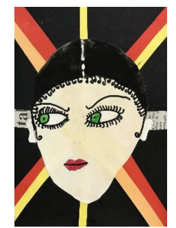
Collage, watercolour and layout