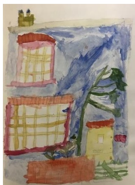
Observational drawing, watercolour use