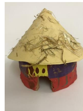
Clay skills, 3D observation, sculpture