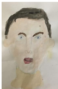
Proportion, drawing from life