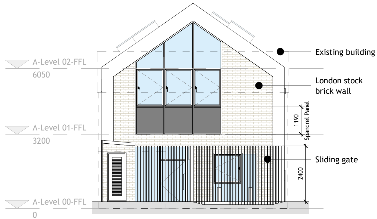
1 Cross St. / Front Elevation (SW) 1 : 100