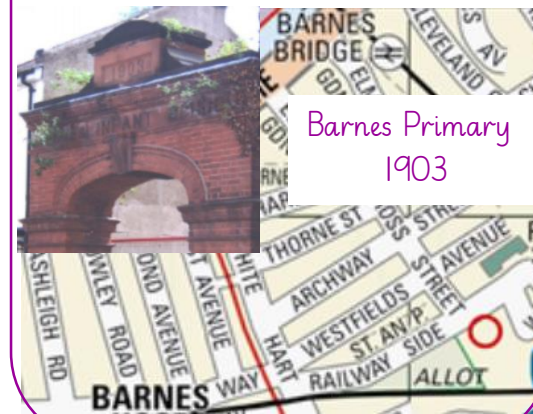
Barnes Primary 1903