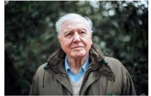
Sir David Attenborough – Born 1926