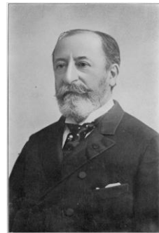
Saint-Saens 1835 - 1921

Here are some animals that feature in the suite.