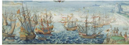
Spanish Armada, 1558

Daughter of King Henry VIII, she was the last of the Tudor family to rule England. Defeat of the Spanish Armada in 1558.